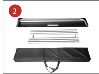
2. Take out the parts of the frame from the bag.