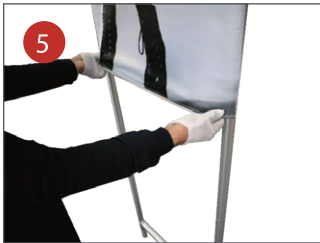
5. To install the graphic, slide the graphic from the top of the frame towards the bottom.