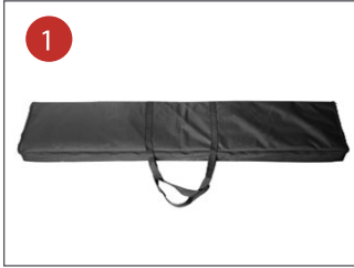
1. Waveline Bannerstand black padded bag.