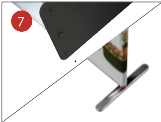
7. Attach base with provided screws -or- Attach feet option