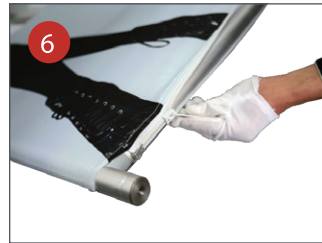
6. Zip the bottom of the graphic.