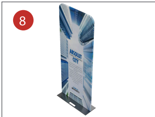
8. Completed Waveline Bannerstand